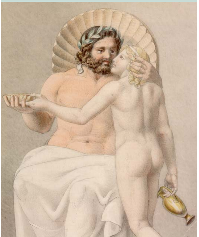
Zeus und Ganymed, Johann Heinrich Meyer, Klassik Stiftung Weimar, Museen